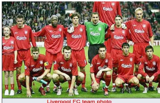
Liverpool FC team photo