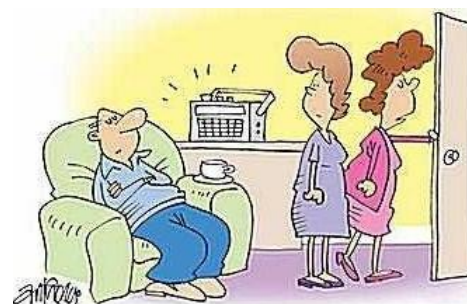
"DON'T WAKE HIM, HE'S LISTENING TO THE CRICKET"