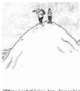
"What a wonderful view, dear ...from up here you can see five different cricket matches!"