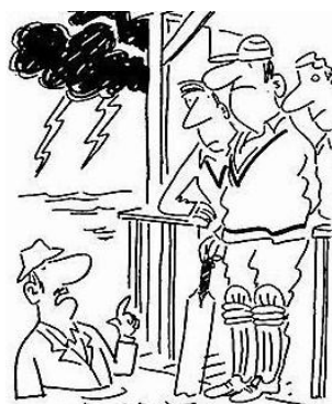
'Crease is still a bit damp...'